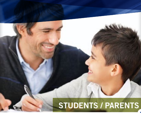
STUDENTS / PARENTS